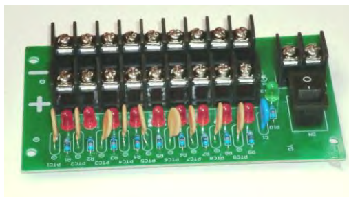
Fig 1: Optional Distribution board